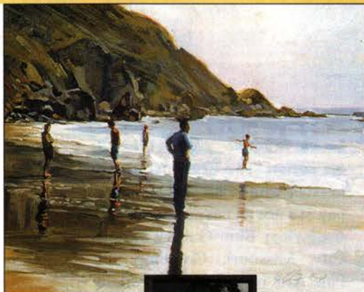
"Alameda Afternoon" (top) and "Solitude."